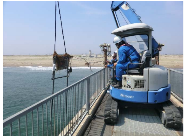
Removal of instrument array