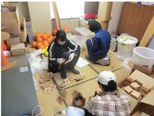
Preparation of frequent seabed sediment sampling.