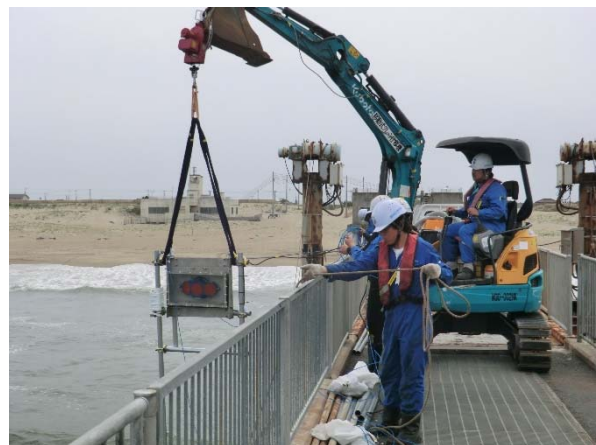
Installation of the instrument array.