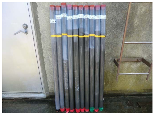
Collected core samples