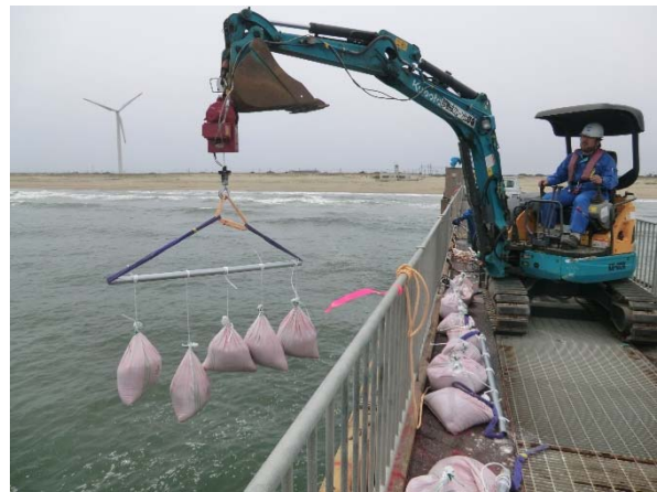
Installation of fluorescent sand tracer