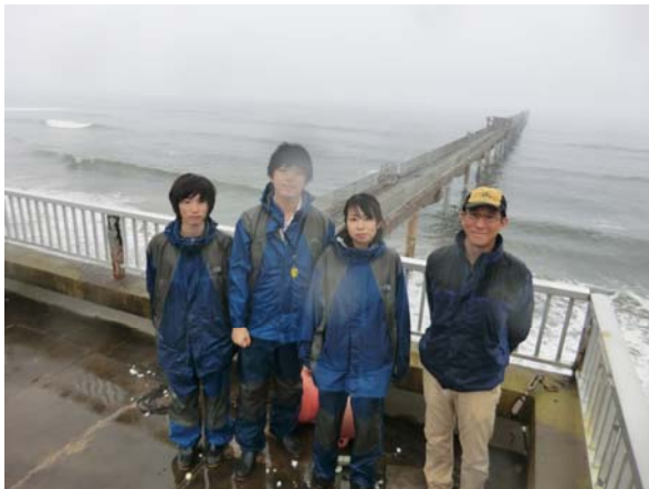
HORS filed survey members