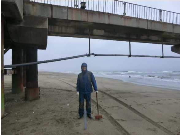
Core sampling at the swash zone