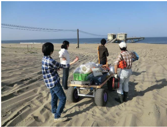
Preparation of the field survey.

The field experiments were conducted at the Hasaki coast, Japan. The objectives of this experiments are to understand the cross-shore and vertical sediment movement in the region from the swash zone to the offshore side. This year, outer bar is not existed.