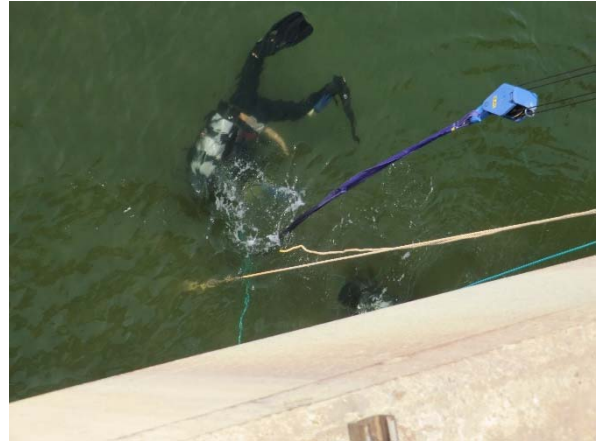
Core sampling by divers